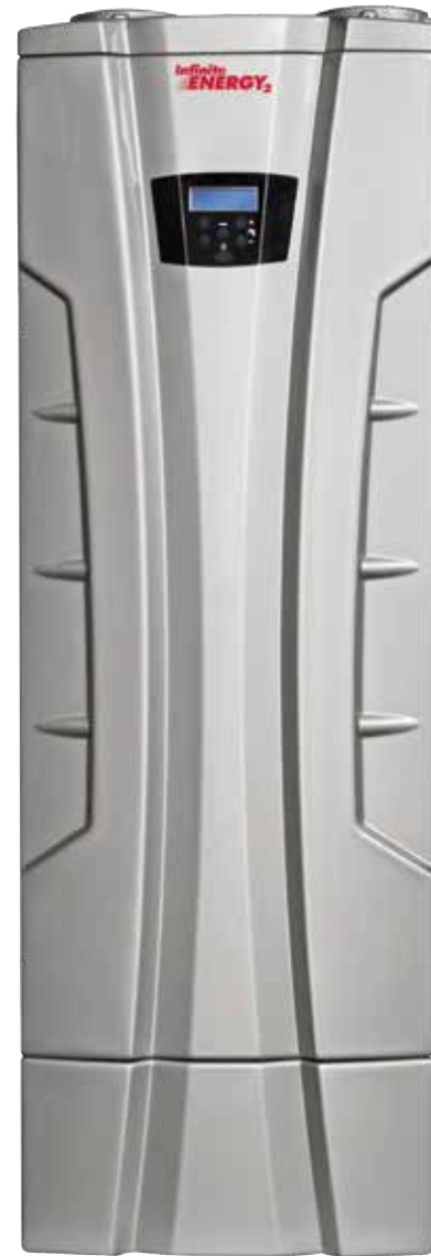
IE2 1 million BTU unit